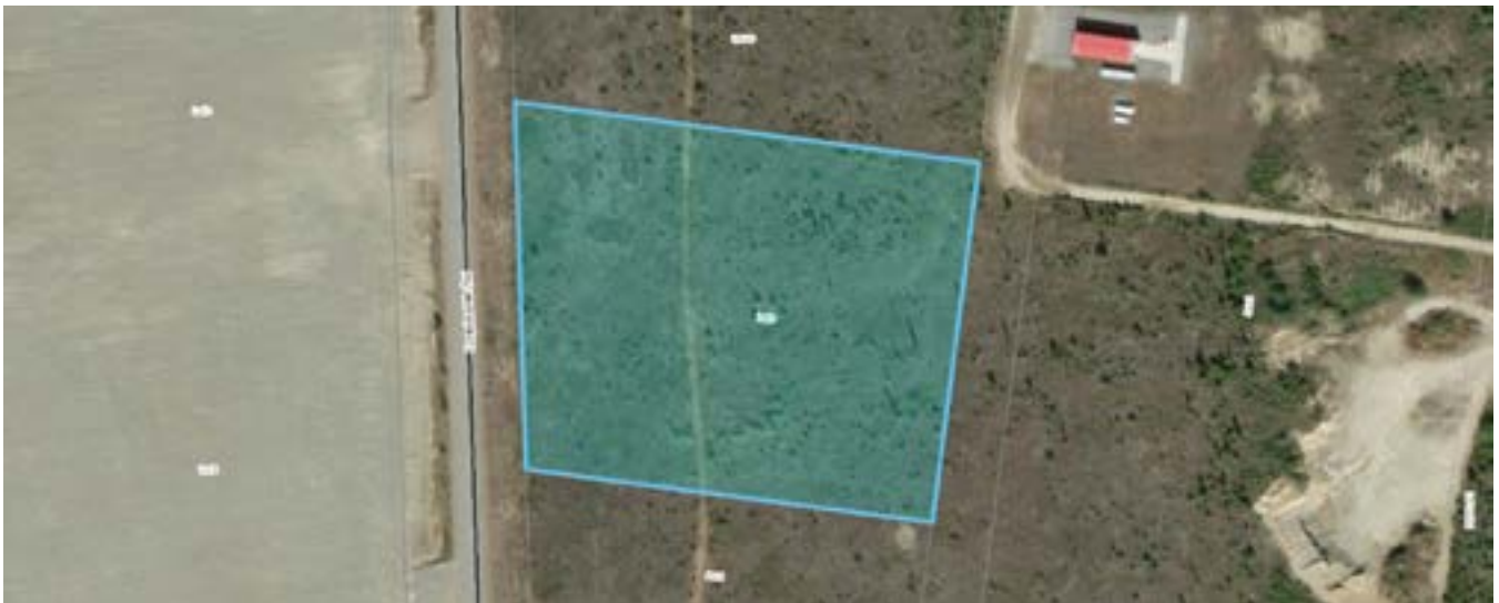
Figure 2: Dimensions of Subject Property