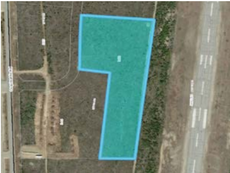
Figure 2: Dimensions of Subject Property