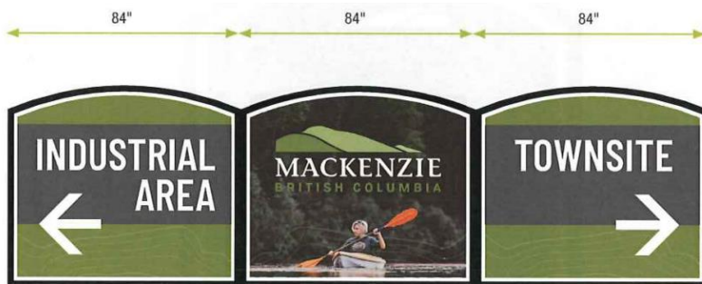
Figure 1: Large 3 Sign - Billboard Style 24ft by 6ft

Council authorized staff to apply for a 30-year Licence of Occupation for a section of Crown Land on Mill Road to install wayfinding signage. The proposed signage options are shown below. Prior to installation a final report will be brought to Council for final design selection.