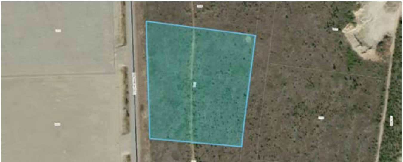
Figure 2: Dimensions of Subject Property