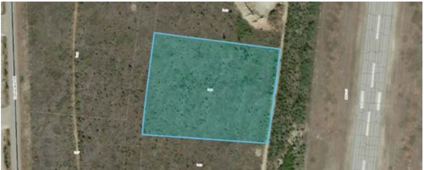
Figure 2: Dimensions of Subject Property