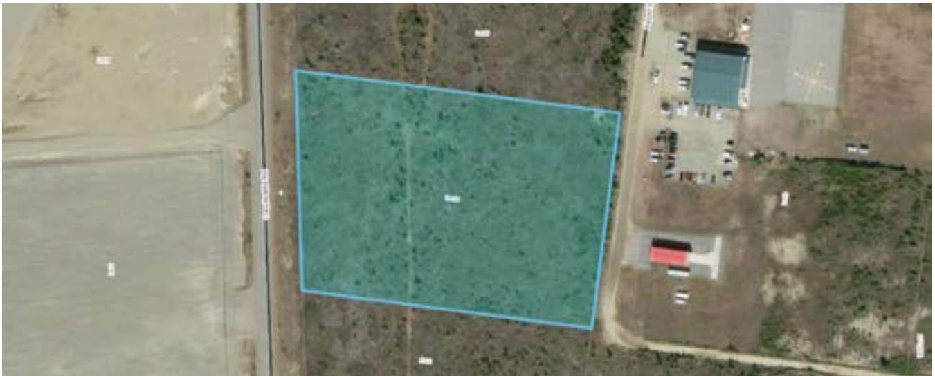
Figure 2: Dimensions of Subject Property